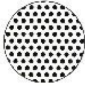
ImageVue & ImageJetVue (1.5-mm holes, 65/35 perforation pattern)