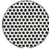
ClassicVue (1.5-mm holes, 50/50 perforation pattern)